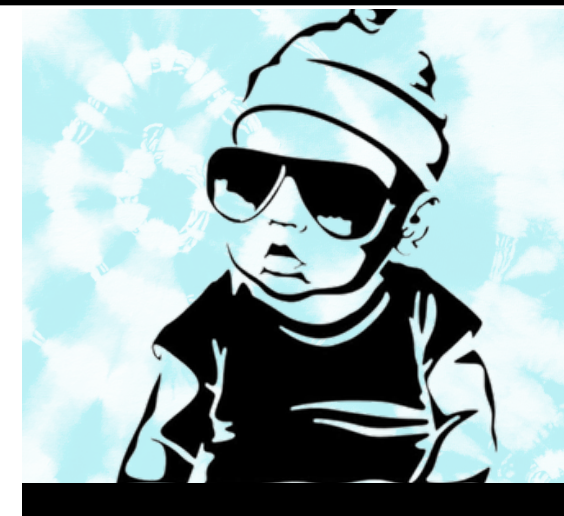
THURSDAYS 10am - 12pm 3 Phillip St, Raymond Terrace