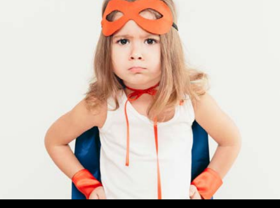
THURSDAYS 22/2/24 - 28/3/24 10am - 12pm 5 Phillip St, Raymond Terrace

Child minding and transport can be provided. To participate parents will need to have an individual caseworker from a relevant service/agency. Each program is limited to 6 participants.