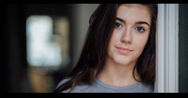
THURSDAYS 22/2/24 - 28/3/24 10am - 12pm The Deck Youth Venue 1a Kangaroo St, Raymond Terrace