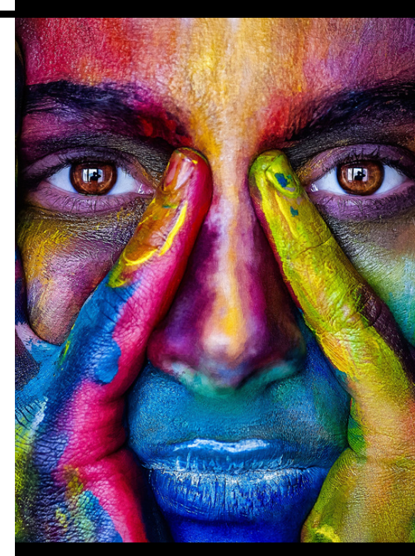
Art Therapy is offered to current clients of PSFaNS. Contact your worker for more information.