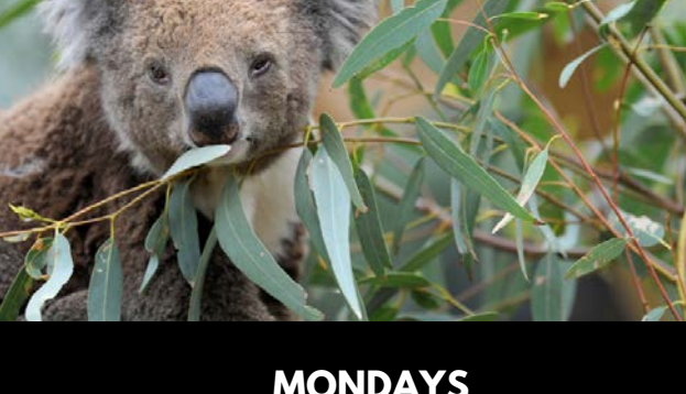
MONDAYS After school til 5pm Lemon Tree Passage Rd, Mallabula

The children, whilst learning about their local environment, are also learning valuable things about themselves. For children in years 3 & 4.