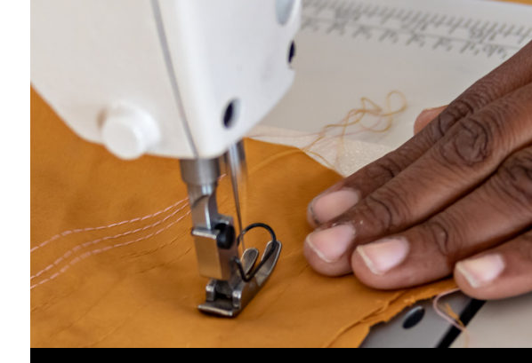
MONDAYS 10am - 12pm KARUAH COMMUNITY HALL